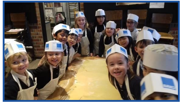
Year 1 Class Team

Last Thursday, we went to the bakery. The trip to the bakery was quite long. We had to take two busses, but it was worth it because we had lots of fun! The baker had an enormous rolling pin which he used to shape and flattens the dough for us! After that, we cut the dough into shapes using various Christmas cookie cutters. In the end, we decorated our cookies with rainbow and chocolate sprinkles. It was hard work, but the cookies were delicious! We hope the parents enjoyed the cookies, too! Merry Christmas!