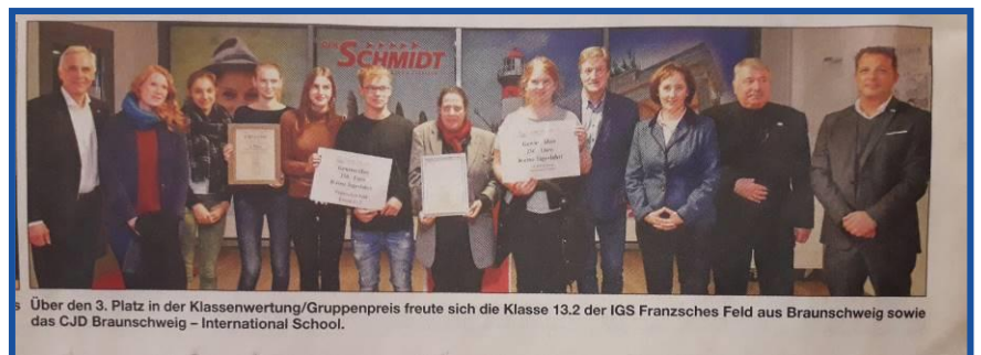
Über den 3. Platz in der Klassenwertung/Gruppenpreis freute sich die Klasse 13.2 der IGS Franzisches Feld aus Braunschweig sowie das CJD Braunschweig – International School.

We are very happy to inform you that Year 8 won an award after taking part in a competition regarding Wilhelm Busch & Co.